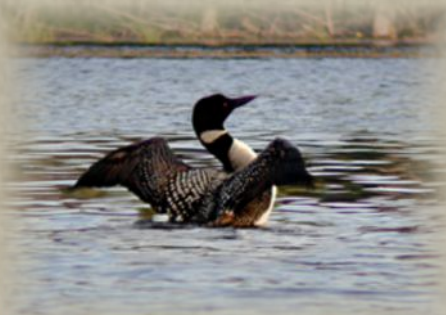
Common Loon Frequent Summer Visitor

Over the years, my husband and I have stayed at many B&B's, and some were so-so while others were absolutely wonderful. The Piel's Forest Gardens Getaway is absolutely wonderful. The accommodations were very comfortable and well-appointed. The view out of every window provides a picture postcard image. Look out the dining room windows and you see the gardens. Look out of the living room and eating nook for views of the private lake. Look out the kitchen and behold! An amazing screened gazebo. Unfortunately, I was there in the winter, but that didn't stop my imagination. I could imagine sitting out there with other guests, sipping on a glass of wine at the end of the day. Alan and Debbie are gracious hosts, and Debbie has the cutest giggle I've ever heard. The food Debbie prepared was what you would expect an "absolutely wonderful" B&B would provide. All in all, I am hoping to get back to Forest Gardens Getaway at some time in the future. The peace and quiet are a balm for my soul. Margaret