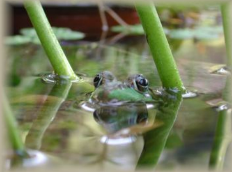
Common Summer Resident