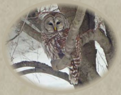
Winter Barred Owl Photo Taken from Garden Bedroom

I have not always been happy with my B&B experiences - bad beds, bad pillows, mediocre food. At Debbie and Alan's it is a different experience. First, the location, and their home, is beautiful. Just what you would want from a serene northwoods adventure. Second, I am not a cook but I do know how to appreciate the very fine food that we were offered. My group of friends enjoyed all Debbie's specialties, snacks and breakfast were generous and delicious. Third, very comfortable beds and great sheets and pillows. Too much info? You can't have too much information when you plan a dreamy retreat! Come and enjoy this northern hospitality. Mary