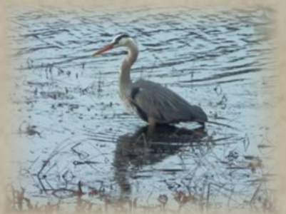
Great Blue Heron Common Summer Resident